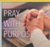
Bishop of Norwich