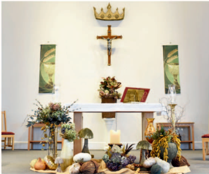
20th Anniversary Celebration Mass Photo